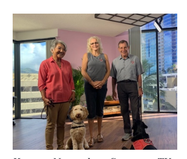
Kupuna Network on Spectrum TV

Check it out at: Available soon on Spectrum Channel 14 & 1014, Amazon FireTV, RoKu TV, YouTube, Facebook, and www.thekupunanetwork.com.